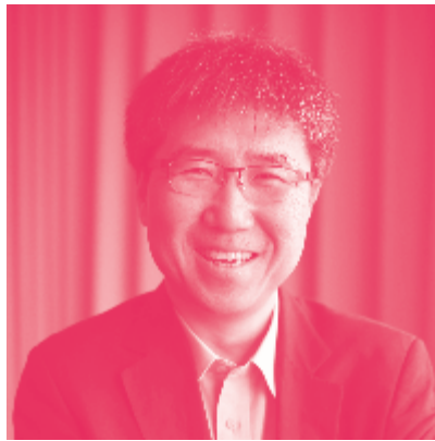
Dr Ha-Joon Chang Council Member