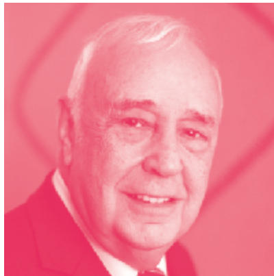
Lord Skidelsky Council Member